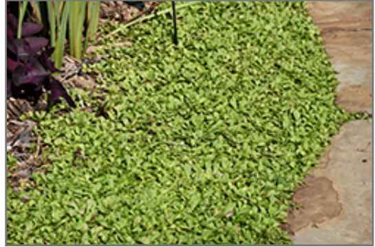
Creeping Mazus

Creeping Mazus is a fine choice for the garden, but it is also a good selection for planting in outdoor pots and containers. Because of its spreading habit of growth, it is ideally suited for use as a 'spiller' in the 'spiller-thriller-filler' container combination; plant it near the edges where it can spill gracefully over the pot. Note that when growing plants in outdoor containers and baskets, they may require more frequent waterings than they would in the yard or garden.