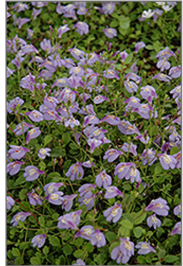
Creeping Mazus flowers