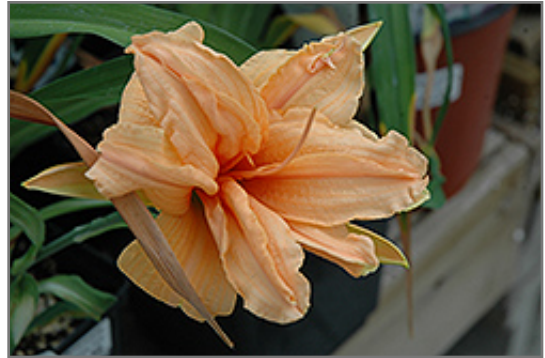
Vanilla Fluff Daylily flowers