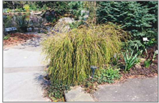
Threadleaf Arborvitae