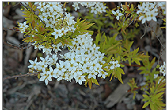
Mellow Yellow Spirea flowers