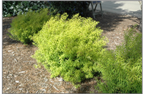
Mellow Yellow Spirea

This is a high maintenance shrub that will require regular care and upkeep, and should only be pruned after flowering to avoid removing any of the current season's flowers. It is a good choice for attracting butterflies to your yard, but is not particularly attractive to deer who tend to leave it alone in favor of tastier treats. It has no significant negative characteristics.