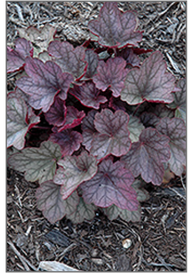
Carnival Rose Granita Coral Bells foliage

Carnival Rose Granita Coral Bells is recommended for the following landscape applications;