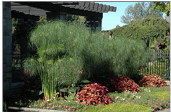
King Tut Egyptian Papyrus