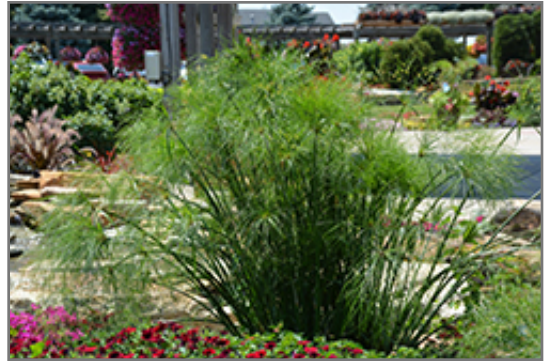
King Tut Egyptian Papyrus