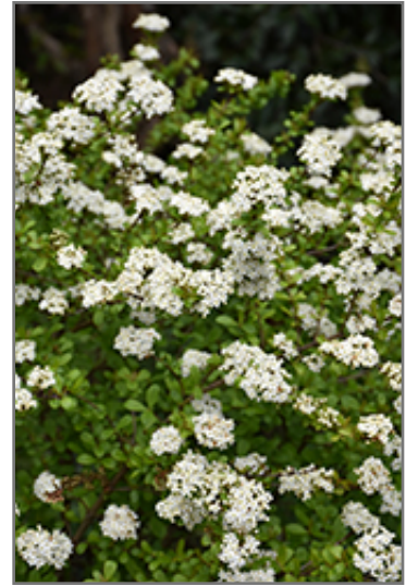
Whorled Class Viburnum flowers

Whorled Class Viburnum is a multi-stemmed evergreen shrub with a more or less rounded form. Its relatively coarse texture can be used to stand it apart from other landscape plants with finer foliage.