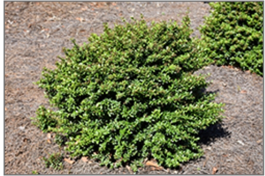
Whorled Class Viburnum

This shrub does best in full sun to partial shade. It is very adaptable to both dry and moist locations, and should do just fine under average home landscape conditions. It may require supplemental watering during periods of drought or extended heat. It is not particular as to soil type or pH. It is highly tolerant of urban pollution and will even thrive in inner city environments. This is a selected variety of a species not originally from North America.