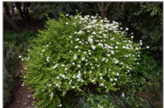
Whorled Class Viburnum in bloom