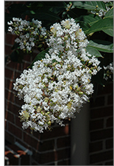
Natchez Crapemyrtle flowers

This is a relatively low maintenance tree, and is best pruned in late winter once the threat of extreme cold has passed. Deer don't particularly care for this plant and will usually leave it alone in favor of tastier treats. It has no significant negative characteristics.