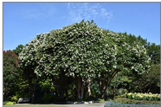
Natchez Crapemyrtle in bloom