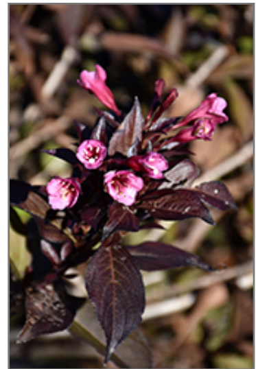
Fine Wine Weigela flowers