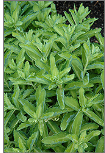
Autumn Delight Stonecrop foliage

Autumn Delight Stonecrop is a fine choice for the garden, but it is also a good selection for planting in outdoor pots and containers. It is often used as a 'filler' in the 'spiller-thriller-filler' container combination, providing a mass of flowers and foliage against which the larger thriller plants stand out. Note that when growing plants in outdoor containers and baskets, they may require more frequent waterings than they would in the yard or garden.