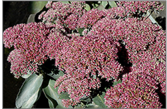
Autumn Delight Stonecrop flowers

Autumn Delight Stonecrop is a dense herbaceous perennial with an upright spreading habit of growth. Its relatively coarse texture can be used to stand it apart from other garden plants with finer foliage.