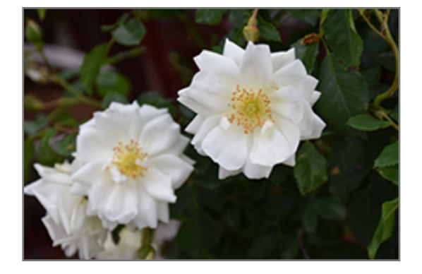
Flower Carpet White Rose flowers