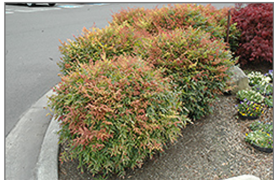
Sienna Sunrise Nandina