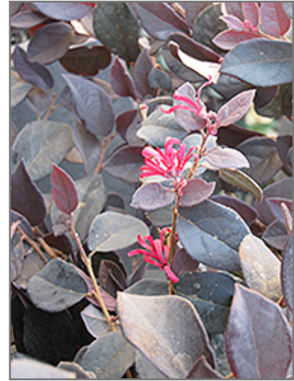
Purple Pixie Fringeflower flowers

Purple Pixie Fringeflower is recommended for the following landscape applications;