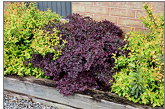
Purple Pixie Fringeflower