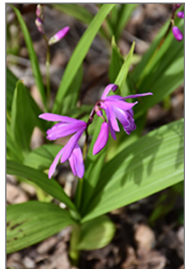
Lavender Japanese Hyacinth Orchid flowers