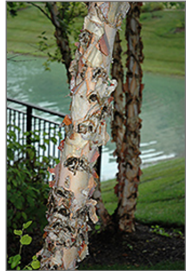
River Birch bark