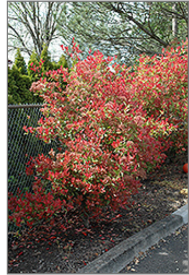
Fraser Photinia in bloom