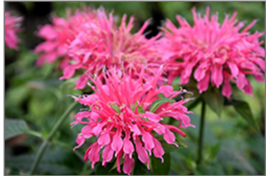
Coral Reef Beebalm flowers

Coral Reef Beebalm is recommended for the following landscape applications;