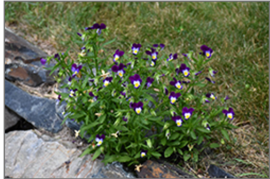
Johnny Jump-Up in bloom

Johnny Jump-Up will grow to be only 4 inches tall at maturity extending to 6 inches tall with the flowers, with a spread of 6 inches. When grown in masses or used as a bedding plant, individual plants should be spaced approximately 5 inches apart. It grows at a fast rate, and tends to be biennial, meaning that it puts on vegetative growth the first year, flowers the second, and then dies. However, this species tends to self-seed and will thereby endure for years in the garden if allowed. As an herbaceous perennial, this plant will usually die back to the crown each winter, and will regrow from the base each spring. Be careful not to disturb the crown in late winter when it may not be readily seen!