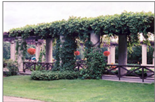
Virginia Creeper