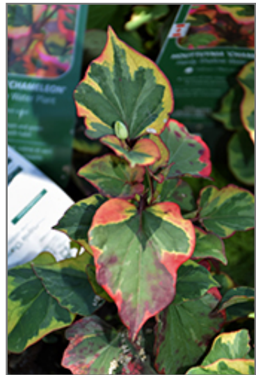
Variegated Chameleon Plant foliage