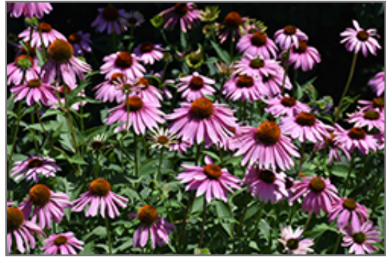
Magnus Coneflower flowers