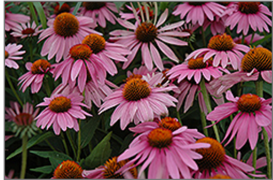
Magnus Coneflower flowers

Magnus Coneflower is an herbaceous perennial with an upright spreading habit of growth. Its medium texture blends into the garden, but can always be balanced by a couple of finer or coarser plants for an effective composition.