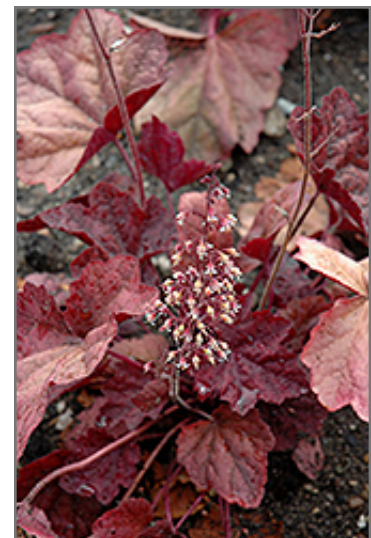
Lava Lamp Coral Bells flowers