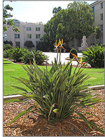
Orange Bird Of Paradise in bloom

Orange Bird Of Paradise is a fine choice for the garden, but it is also a good selection for planting in outdoor pots and containers. With its upright habit of growth, it is best suited for use as a 'thriller' in the 'spiller-thriller-filler' container combination; plant it near the center of the pot, surrounded by smaller plants and those that spill over the edges. It is even sizeable enough that it can be grown alone in a suitable container. Note that when growing plants in outdoor containers and baskets, they may require more frequent waterings than they would in the yard or garden.