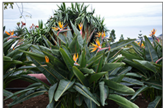
Orange Bird Of Paradise in bloom