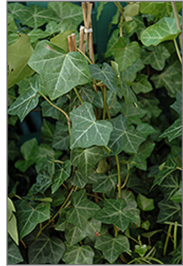
Thorndale Ivy foliage

Thorndale Ivy is recommended for the following landscape applications;