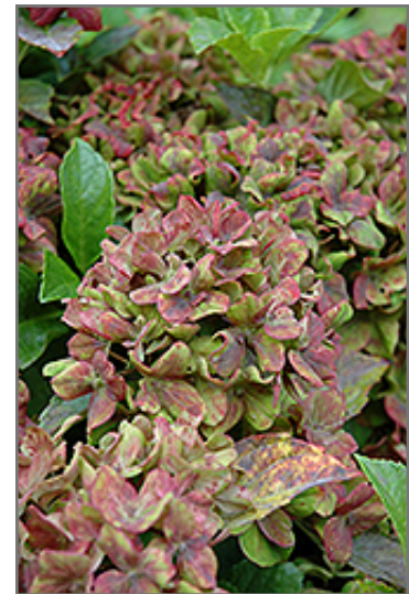
Pistachio Hydrangea flowers