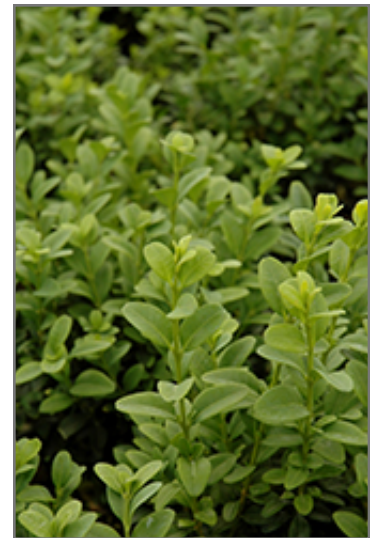
Julia Jane Boxwood foliage