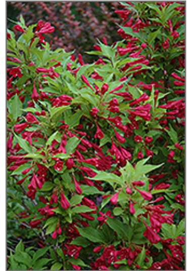
Red Prince Weigela flowers

This shrub should only be grown in full sunlight. It prefers to grow in average to moist conditions, and shouldn't be allowed to dry out. It may require supplemental watering during periods of drought or extended heat. It is not particular as to soil type or pH. It is highly tolerant of urban pollution and will even thrive in inner city environments. This is a selected variety of a species not originally from North America.