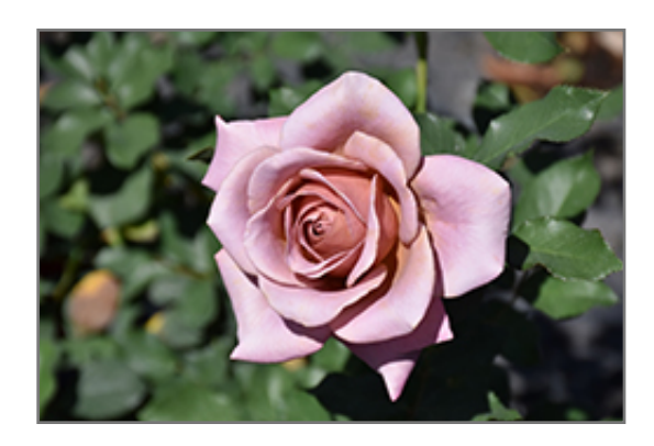
Koko Loko Rose flowers