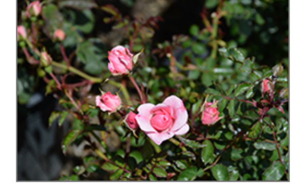
Bonica Rose flower buds