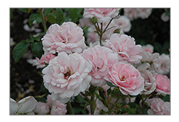
Bonica Rose flowers

A Meidiland series rose, absolutely smothered in double light pink flowers in early summer, repeat-blooming; compact, mounded habit, quite hardy and resistant to disease, a valuable garden shrub; all roses need full sun and well-drained soil