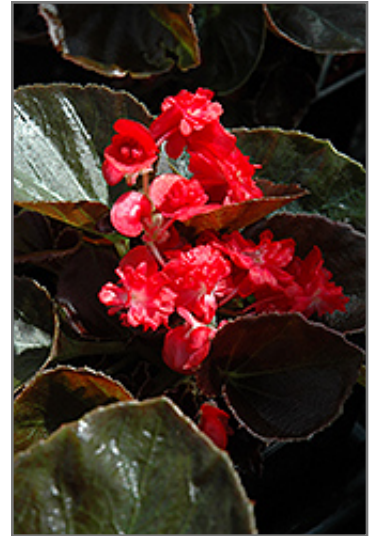
Doublet Red Begonia flowers