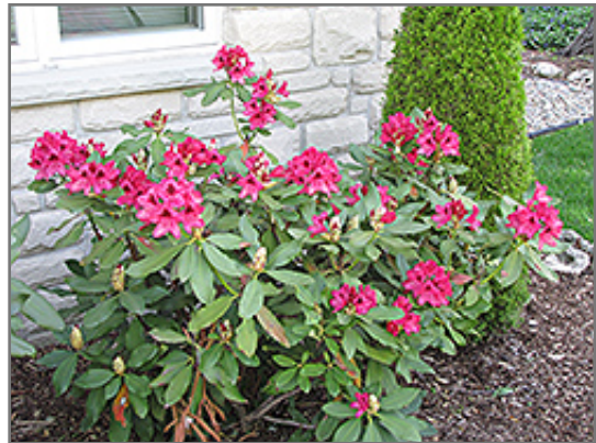
Nova Zembla Rhododendron in bloom