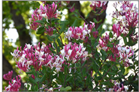
Peaches And Cream Honeysuckle flowers

Peaches And Cream Honeysuckle will grow to be about 20 feet tall at maturity, with a spread of 24 inches. As a climbing vine, it tends to be leggy near the base and should be underplanted with low-growing facer plants. It should be planted near a fence, trellis or other landscape structure where it can be trained to grow upwards on it, or allowed to trail off a retaining wall or slope. It grows at a medium rate, and under ideal conditions can be expected to live for approximately 20 years.