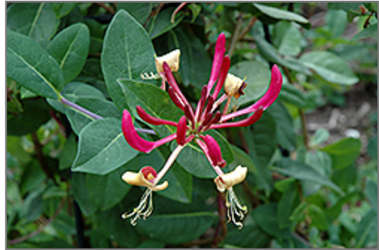
Peaches And Cream Honeysuckle flowers

This woody vine will require occasional maintenance and upkeep, and is best pruned in late winter once the threat of extreme cold has passed. It is a good choice for attracting butterflies and hummingbirds to your yard. It has no significant negative characteristics.