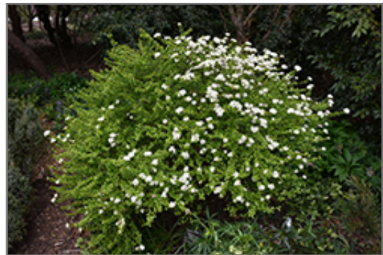
Whorled Class Viburnum in bloom