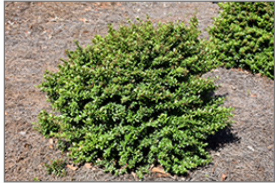
Whorled Class Viburnum

This shrub does best in full sun to partial shade. It is very adaptable to both dry and moist locations, and should do just fine under average home landscape conditions. It may require supplemental watering during periods of drought or extended heat. It is not particular as to soil type or pH. It is highly tolerant of urban pollution and will even thrive in inner city environments. This is a selected variety of a species not originally from North America.