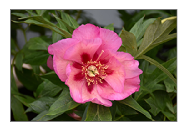
Takara Peony flowers

Large semi-double blooms up to six inches across held on strong stems above luxurious foliage; pale yellow blooms heavily flushed with hot pink mature to pale white with a burgundy flare; an excellent landscape plant