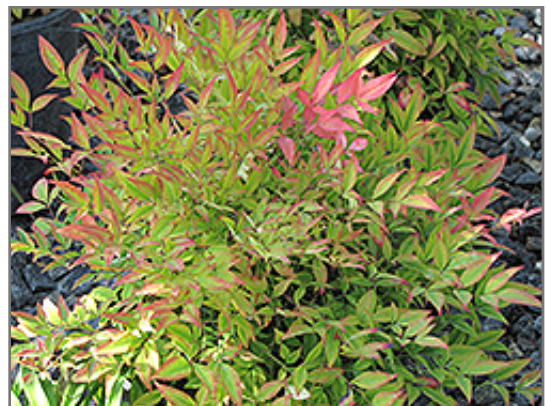
Moon Bay Dwarf Nandina