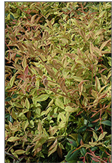
Gulf Stream Dwarf Nandina foliage