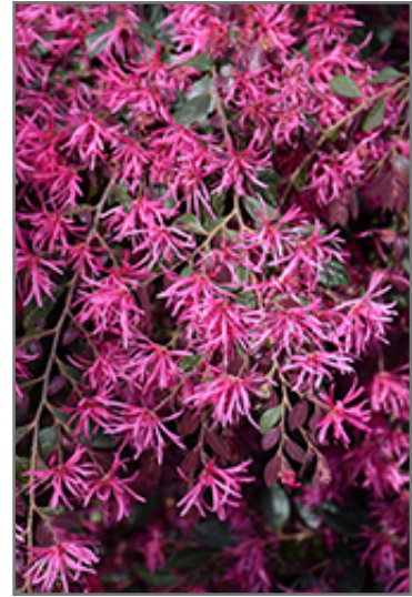
Plum Delight Chinese Fringeflower flowers

Plum Delight Chinese Fringeflower is recommended for the following landscape applications;