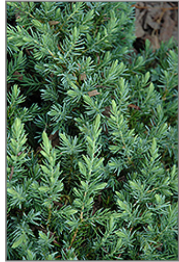
Blue Pacific Shore Juniper foliage