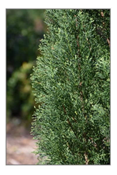
Blue Italian Cypress foliage