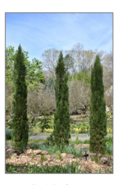
Blue Italian Cypress