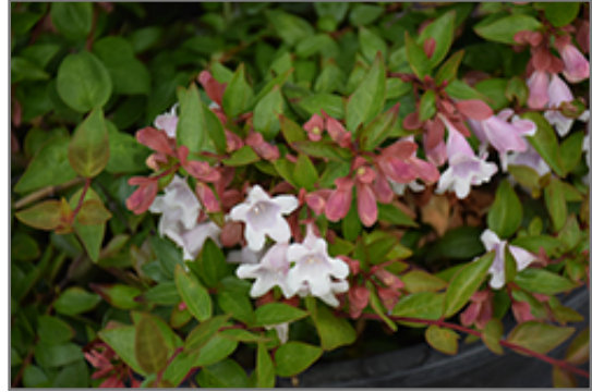
Edward Goucher Abelia flowers

This shrub will require occasional maintenance and upkeep, and should only be pruned after flowering to avoid removing any of the current season's flowers. It is a good choice for attracting birds, bees and butterflies to your yard, but is not particularly attractive to deer who tend to leave it alone in favor of tastier treats. It has no significant negative characteristics.