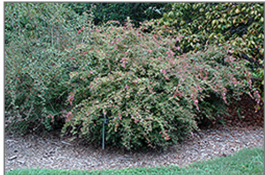
Edward Goucher Abelia in bloom