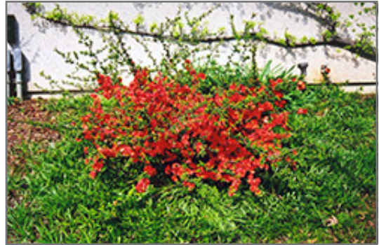
Common Flowering Quince in bloom

This is a high maintenance shrub that will require regular care and upkeep, and should only be pruned after flowering to avoid removing any of the current season's flowers. Gardeners should be aware of the following characteristic(s) that may warrant special consideration;