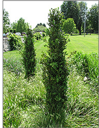
Graham Blandy Boxwood