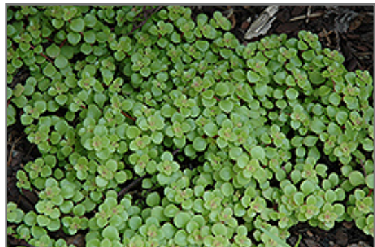
Golden Stonecrop