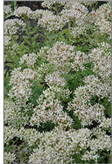
Thundercloud Stonecrop flowers

This is a relatively low maintenance plant, and is best cleaned up in early spring before it resumes active growth for the season. It is a good choice for attracting bees and butterflies to your yard, but is not particularly attractive to deer who tend to leave it alone in favor of tastier treats. It has no significant negative characteristics.