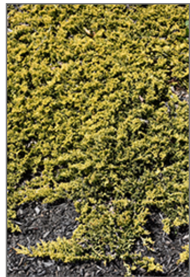
Mother Lode Juniper foliage