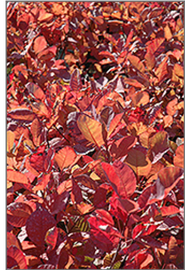
Grace Smokebush in fall

This shrub should only be grown in full sunlight. It is very adaptable to both dry and moist locations, and should do just fine under average home landscape conditions. It may require supplemental watering during periods of drought or extended heat. It is not particular as to soil type or pH. It is highly tolerant of urban pollution and will even thrive in inner city environments, and will benefit from being planted in a relatively sheltered location. This particular variety is an interspecific hybrid.