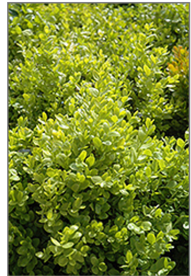
Dwarf English Boxwood foliage