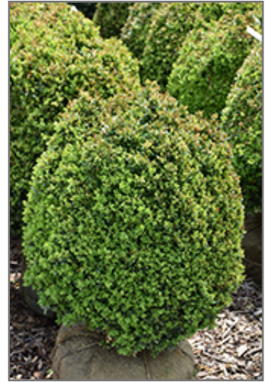
Dwarf English Boxwood