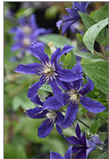
Sapphire Indigo Clematis flowers