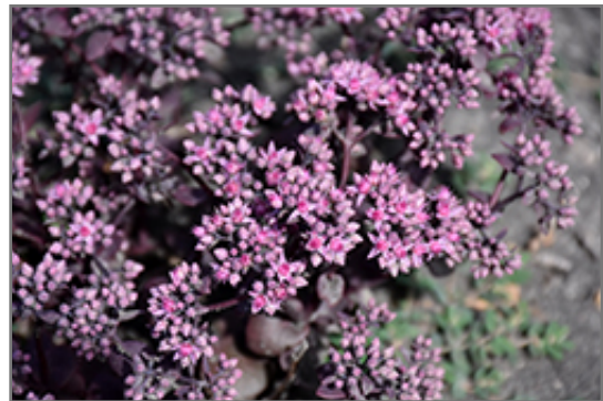
Red Carpet Stonecrop flowers