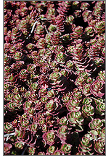
Red Carpet Stonecrop foliage

Red Carpet Stonecrop is a dense herbaceous perennial with a ground-hugging habit of growth. It brings an extremely fine and delicate texture to the garden composition and should be used to full effect.