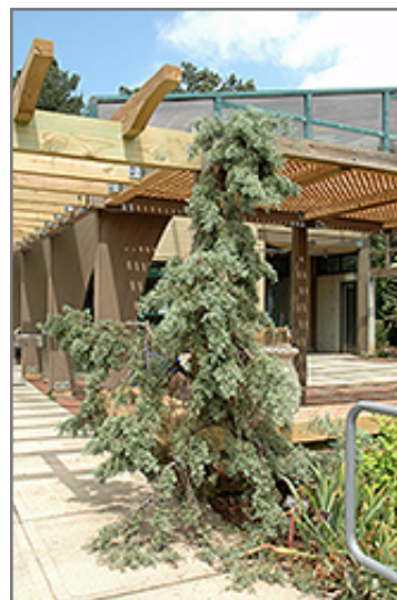
Raywood's Weeping Arizona Cypress